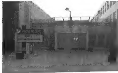
Park slope elementary school, Park slope NY