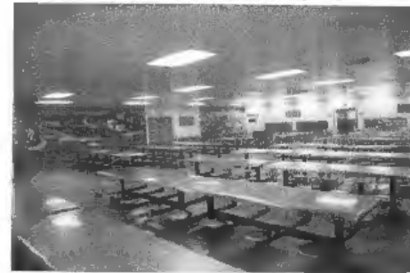
Pitchess Detention center South Facility, Los Angeles California