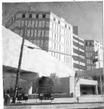
Twin Towers correctional facility, Los Angeles