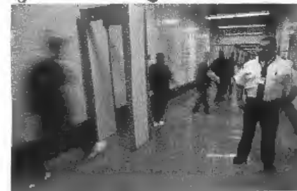
Florence correctional center, Florence AZ