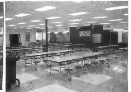
Hononegah High school, Rockton, IL