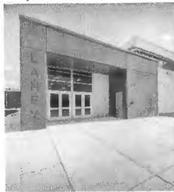
Laney High school, North Carolina