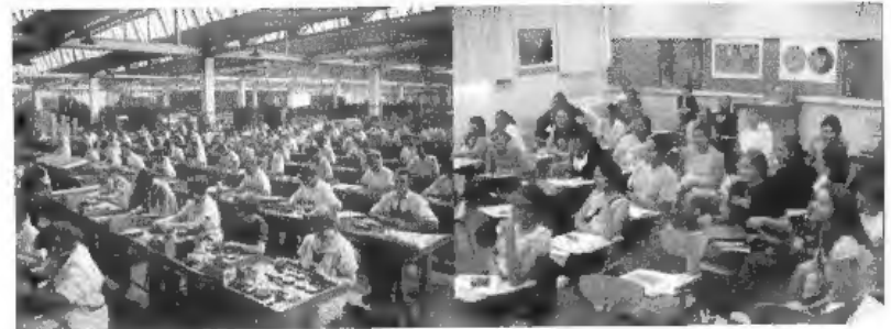
Early 20th century factory and modern classroom