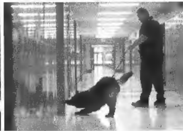
Seymour High school, Connecticut