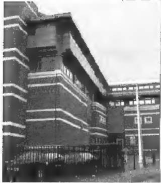
Strangeways prison, Manchester, UK