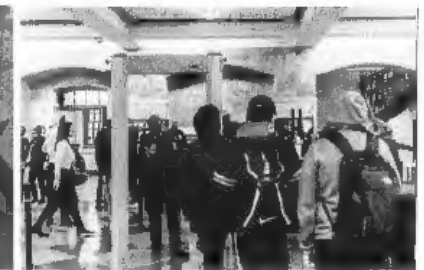
New York school